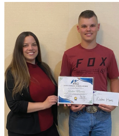
Kaden Morris Center for Career & Technical Education